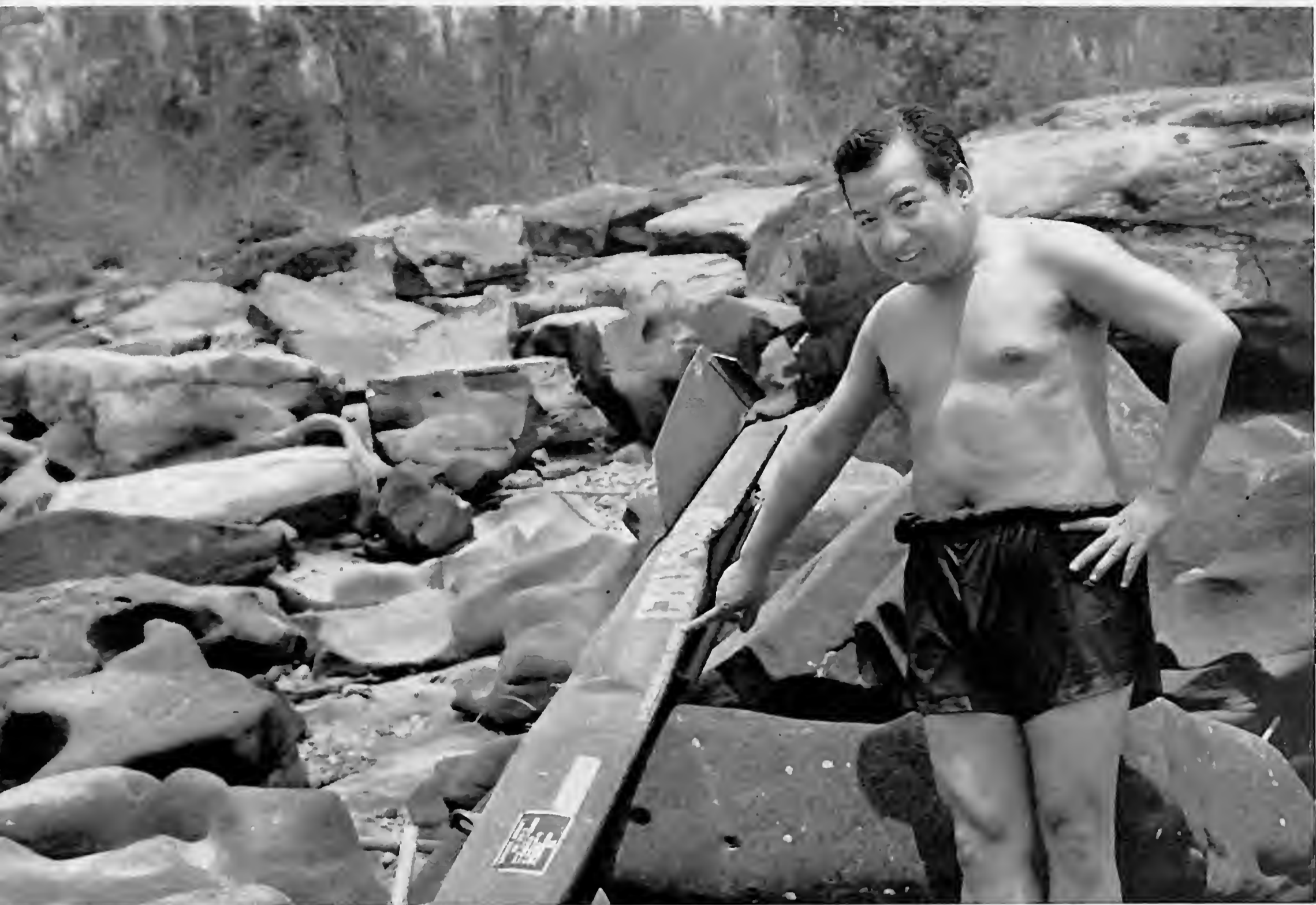
Samdech Sihanouk identifying a U.S. bomb fragment beside a stream.